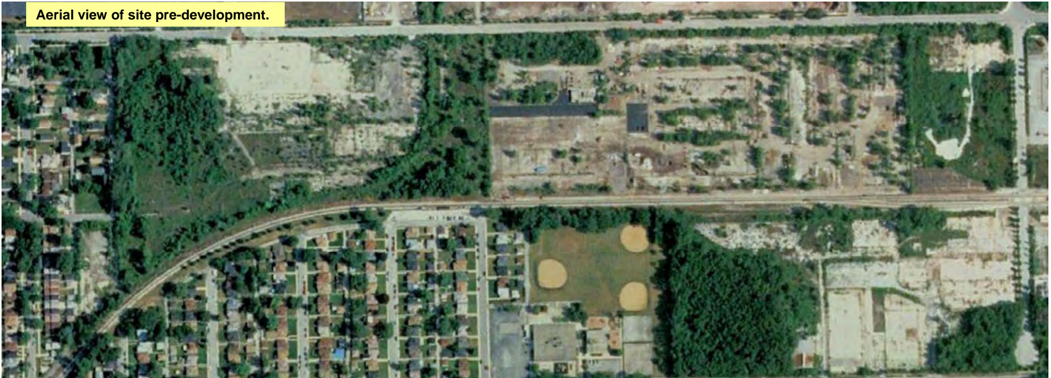
Aerial view of site pre-development.