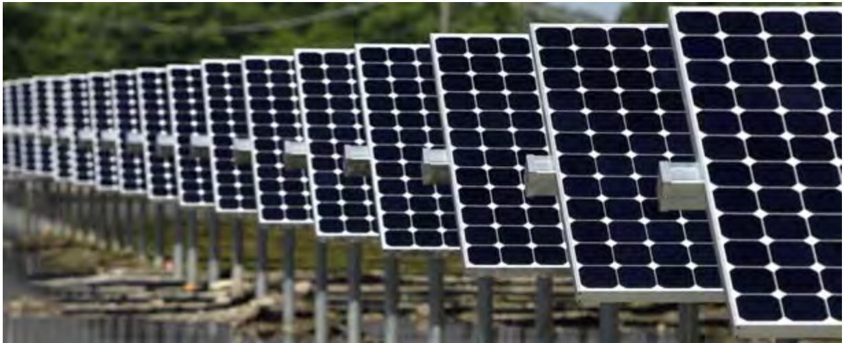
Panels at the SunPower solar plant in Chicago's West Pullman neighborhood.

Operated by Exelon Corp., the 40 acres of panels in West Pullman is the nation's largest urban solar plant, generating 10 megawatts of clean power and hope for an Illinois industry that has long waited for its moment in the sun.