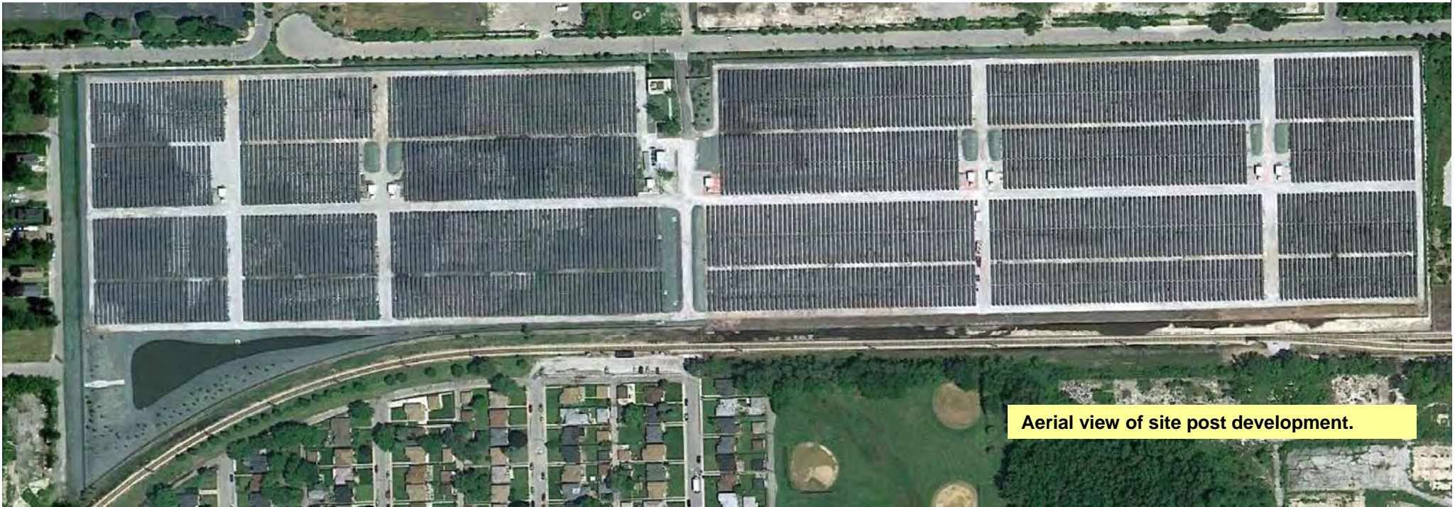
Aerial view of site post development.