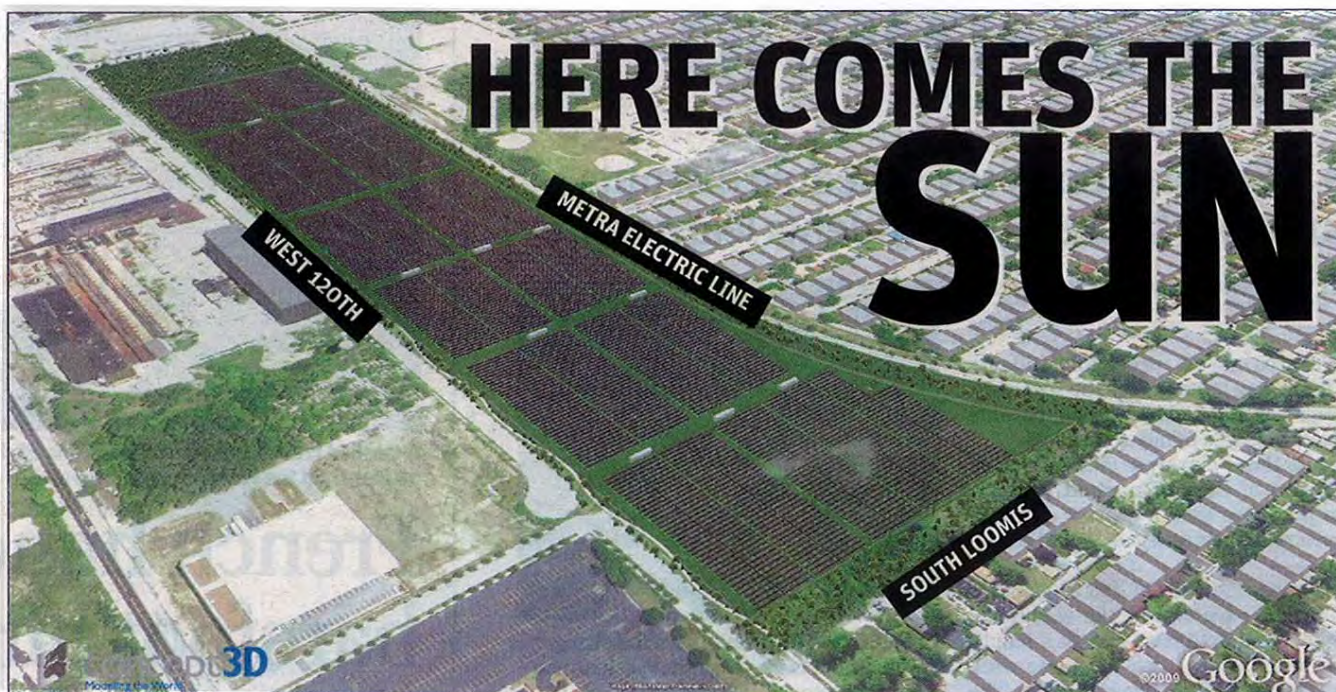
ABOVE: The 10-megawatt solar electric plant is proposed for this area on the South Side. Below: Looking southeast from 120th Street at a large section of property that might be the site of the new Exelon facility.