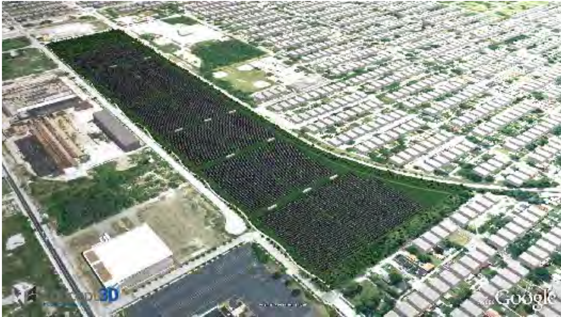
An aerial-view rendering of the proposed Exelon Chicago Solar Power Plant.

By Joshua Boak | Tribune reporter April 22, 2009